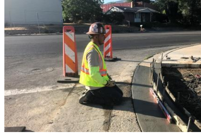
Workers ensure that concrete is level.