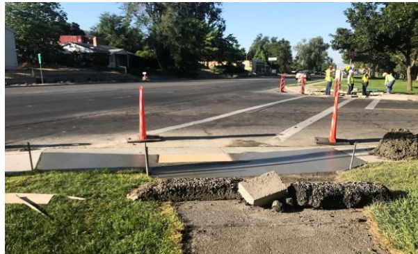
Crews have just finished pouring and leveling concrete.

Construction on pedestrian ramps will generally take place Monday through Friday during daytime hours. Some evening, Saturday or holiday work may also take place. Most work will be staged on side streets so traffic along US-89 isn't impacted.