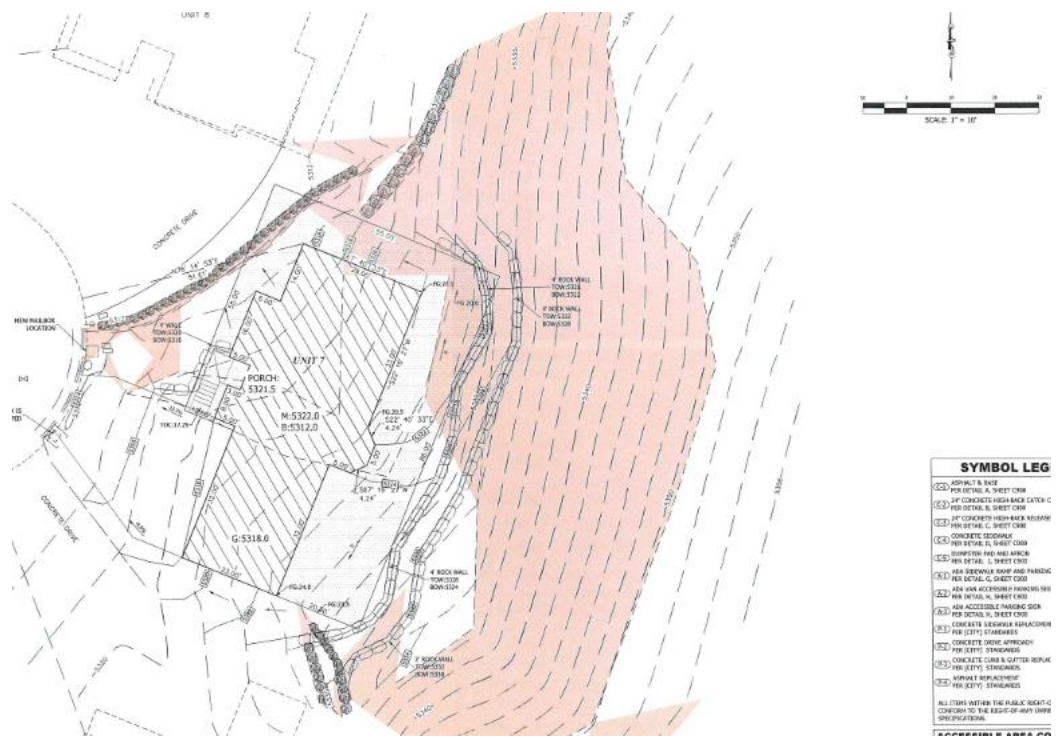
Figure 1 Unit 7 Original Site Plan Shaded are indicates slopes>30%