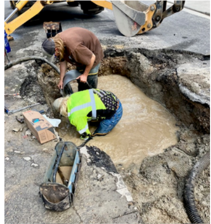
BEHIND THE SCENES: BOUNTIFUL'S WATER DEPT IN ACTION

BOUNTIFUL CITY HALL - 795 S MAIN ST. - 801.298.6140