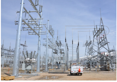
acy Highway at Parrish Lane in Centerville.

A major part of this project involved replacing a single 43-year-old circuit breaker and upgrading the The substation can be seen from Legsubstation to include an additional breaker or path for