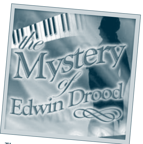
The Mystery of Edwin Drood