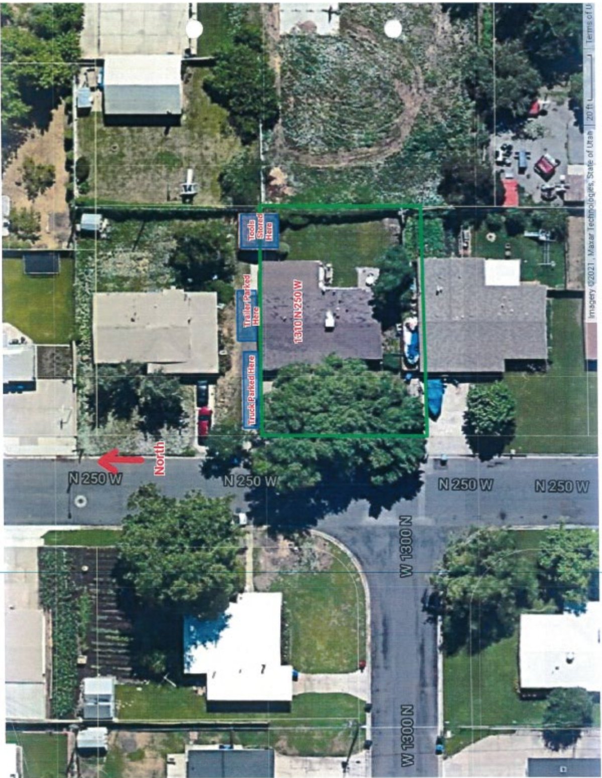
Attachment 3 – Site Plan