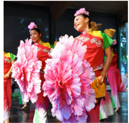
Summer in Bountiful - Farmers Market, Music in the Park concerts and Summerfest!

Bountiful City Hall • 795 South Main Street • 801.298.6140