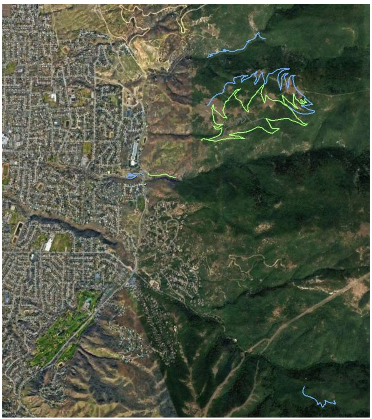
Figure 1: Design & Flagging for 2023