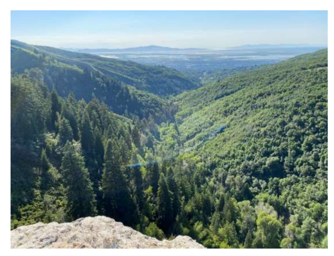
Figure 1 Mueller Park from Big Rock