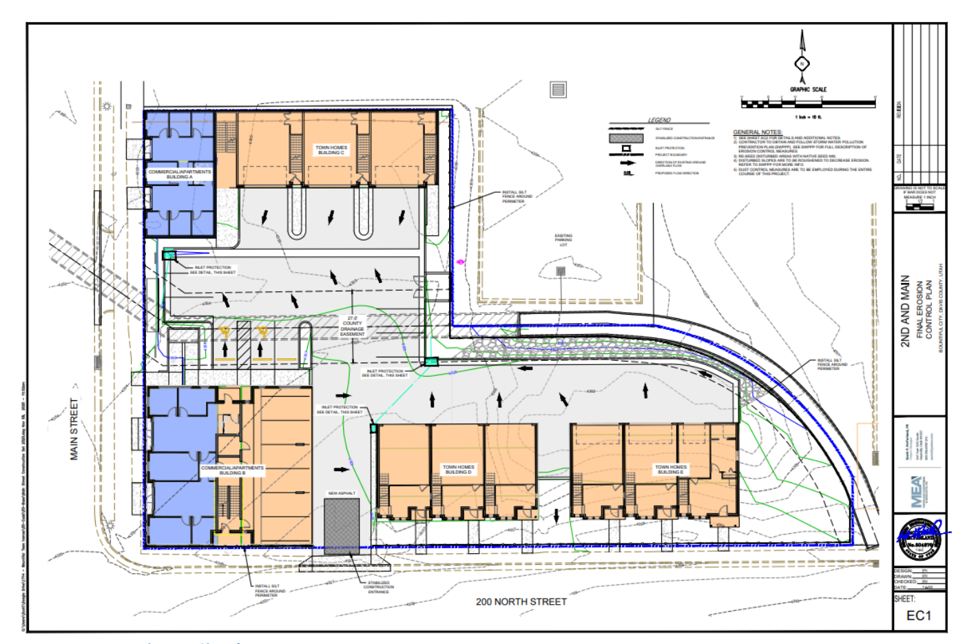
Figure 1 Site Plan