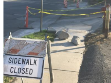
Sidewalks will be closed in areas where crews are working.