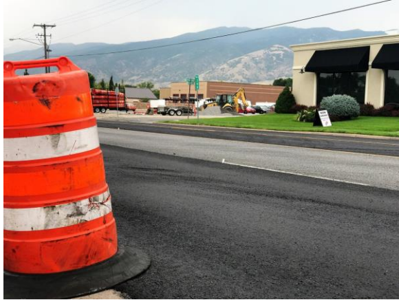
Microsurfacing work is in progress on US-89 at mile post 388.

Asphalt paving will still begin nightly at 7:00 p.m. and take place until about 7:00 a.m. the following morning. US-89 will continue to have lane closures and traffic control devices in place. Traffic will be open, but will be restricted to one lane in each direction.