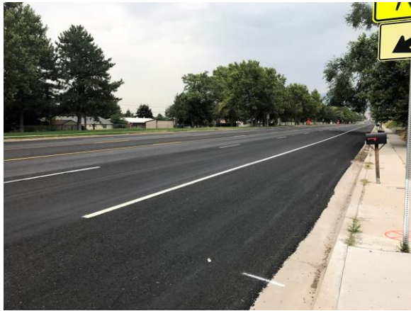
Microsurfacing work along US-89 from Eagle Ridge Drive to the I-15 connection is complete.

A street sweeper will soon be coming through the project corridor. Construction crews will continue to work overnight to lay any remaining pavement markings such as turn arrows and crosswalk bars. To accomplish this task, single lane closures will be required during the hours of 7:00 p.m. to 7:00 a.m.